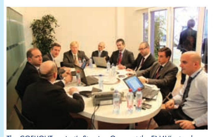
The COFLIGHT project's Steering Group at the ENAV's stand.