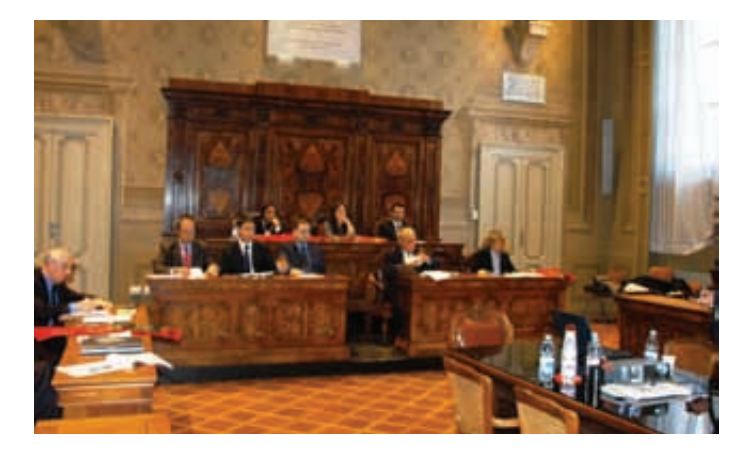
Forli 11th - 29th October - The second Engineering Faculty of the University of Bologna and ENAV organise the second edition of the "School in Aviation Management" in order to promote the integration amongst the main air transport industry operators through training activities. In the photograph, a moment of the course organized in Calamandrei Room in Forli's Council building.