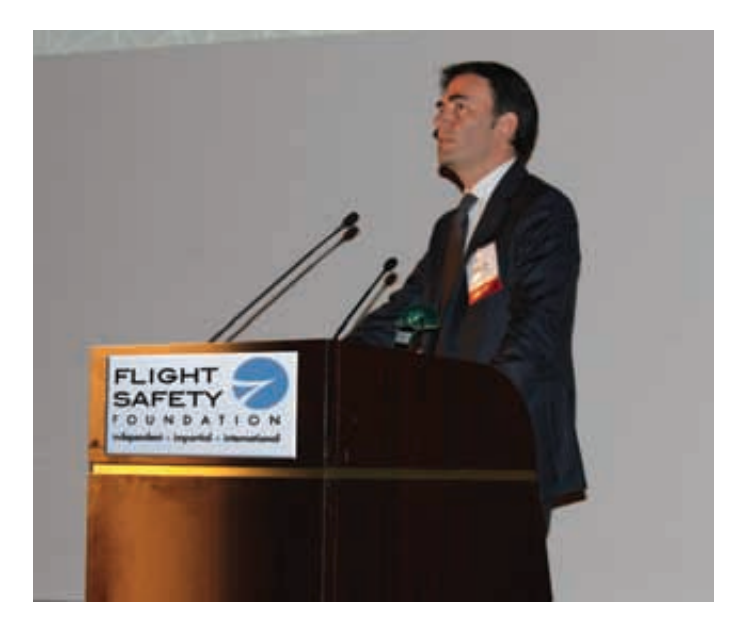
Milano 5th November - Massimo Garbini, ENAV's Director General, attends the International congress on air traffic safety IASS 2010, organized by the Flight Safety Foundation, the "Fondazione 8 Ottobre" 2001 and the Centro Studi Demetra.