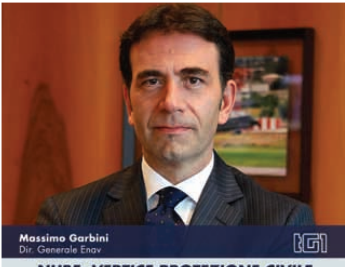
NUBE, VERTICE PROTEZIONE CIVILE